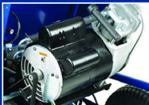
Single motor operates both the pump and the compressor.*