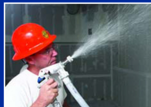
Optional fine finish kit produces a fan spray pattern (287227).