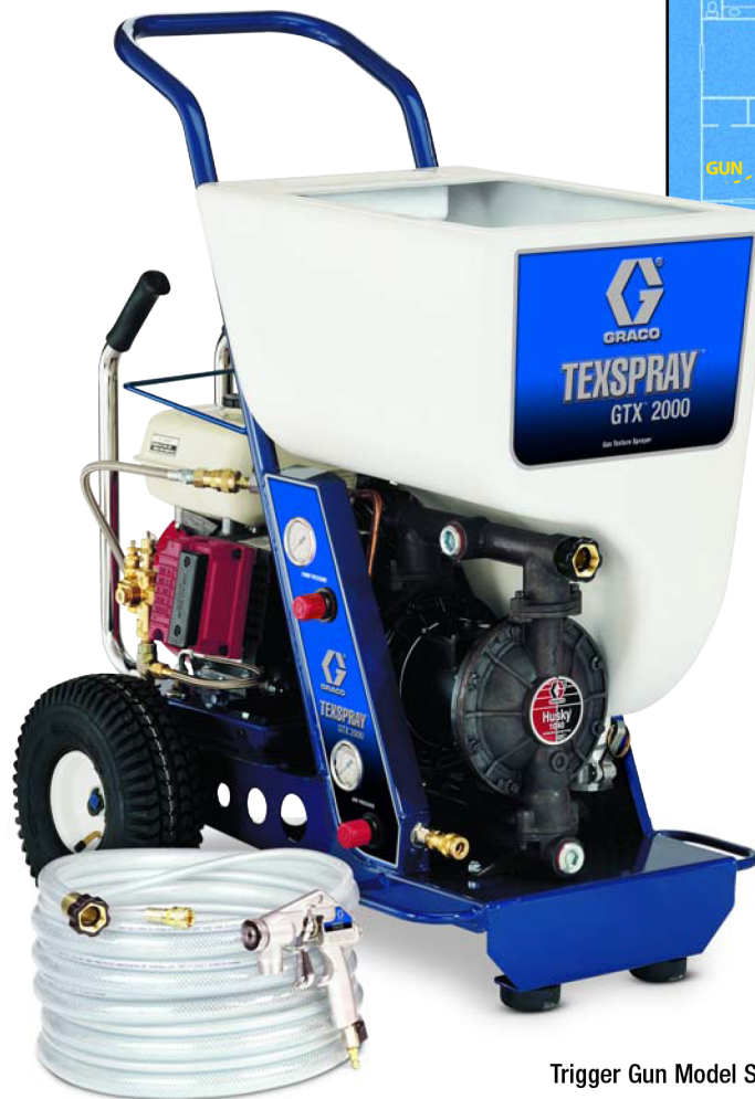
Trigger Gun Model Shown