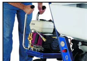
Removable Gas-powered Air Compressor Pack.

Comes complete with: 1 in x 25 ft (25.4 mm x 7.5 m) Hose, Air Spray Trigger Gun, 6 Nozzles