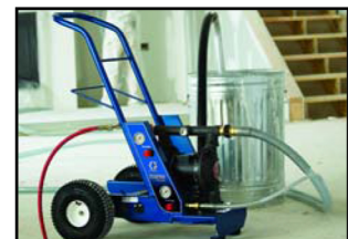
Optional siphon kit draws from your mix container.