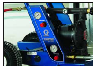
Separate pump and gun air controls.