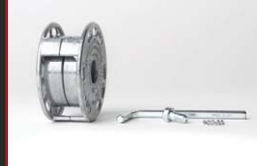
MBX Adapter System USAS-009-23 23 mm width

Made of high quality die cast aluminium, with safety elements