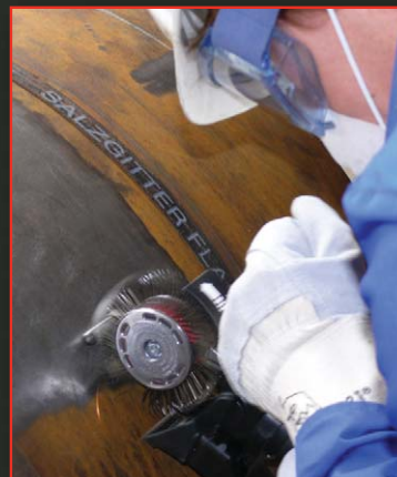
Newly Developed Bristle Blaster