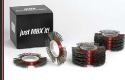
MBX Bristle Blaster Set USBU-110-11 Carbon Steel 11 mm width USBU-160-11 Stainless Steel 11 mm width

Free Speed: 3,200 rpm Voltage Rating: 120 v +/- 10% Amperes: 4 amps Weight: 4.0 pounds Warranty: 6 months