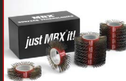
MBX Bristle Blaster Set USBU-110-23 Carbon Steel 23 mm width USBU-160-23 Stainless Steel 23 mm width

0.7 mm spring steel angled, ground and heat treated tips, OD:115mm 0.7mm surgical spring steel, ground tips, OD:115mm