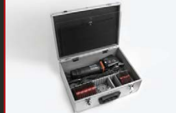
MBX Bristle Blaster Set USSE-06-02 Electric

The MBX System combines ease of use, superior performance and safety of operation in a versatile tool that handles a wide variety of surface preparation tasks.