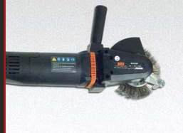
MBX Blaster Electric USSE-06

Free Speed: 3,500 rpm Required Air Pressure: 90 psi Average Air Consumption: 4 cfm Interior Air Hose Size: 3/8" Weight: 2.4 lbs Warranty: 6 months