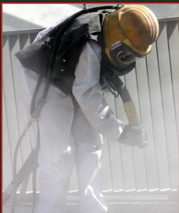
Conventional Grit Blasting