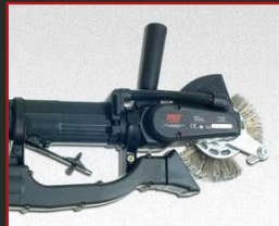
MBX Blaster Pneumatic USSP-06

Free Speed: 3,500 rpm Required Air Pressure: 90 psi Average Air Consumption: 4 cfm Interior Air Hose Size: 3/8" Weight: 2.4 lbs Warranty: 6 months