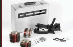
MBX Bristle Blaster Set USSP-06-02 Pneumatic

Made of high quality die cast aluminium, with safety elements