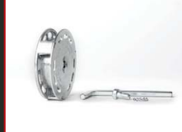
MBX Adapter System USAS-009-11 11 mm width

0.7 mm spring steel angled, ground and heat treated tips, OD:115mm 0.7mm surgical spring steel, ground tips, OD:115mm